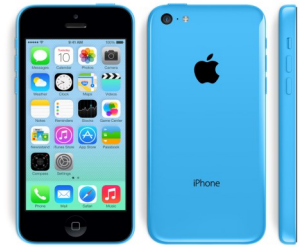
The new iPhone 5c

Xbox One - Released on November 22, 2013. It is built in 2nd generation Kinect. The features are similar to Sony PS4.