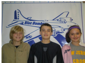
The Towa Times Staff