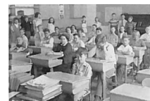
Top — A drawing of the original Towamensing Township School Bottom — 5th and 6th Grade students in 1955.